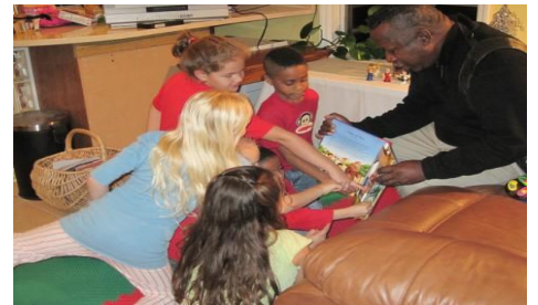
Dec 2010 Family Nativity Night