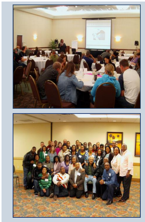
Various marriage retreats in 2010

Being spiritually and technically equipped we followed the leading of the spirit to stand-up a ministry that focused on building healthy families one relationship at a time; thus, the beginning of R.E.L.A.T.E ministry House Church and Community Services Inc.